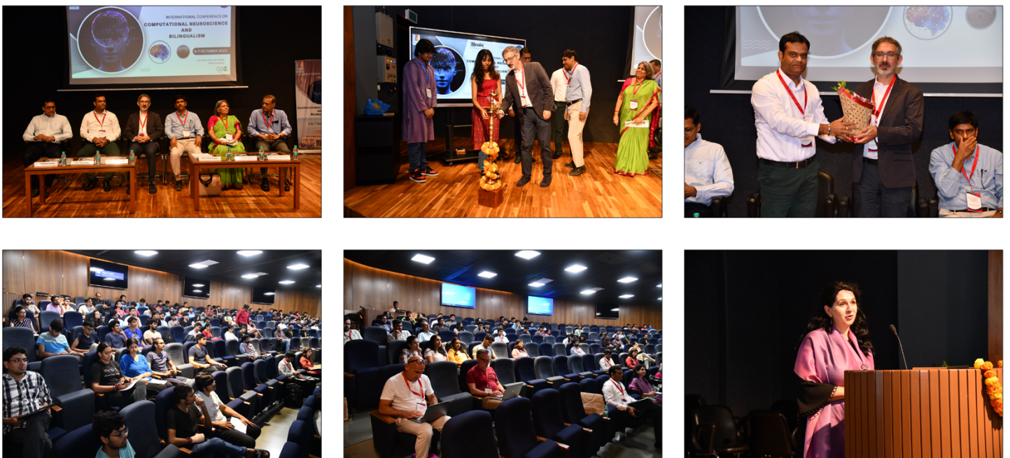
Figure 2 : ICCNB Glimpses.